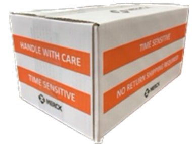
Diluent Shipping Container

A: The Diluent Shipping Container will be used with diluent-only orders or with accompanying frozen shipments sent out in the 12L (for orders of 50-140 doses), 33L, and 77L Reusable Shipping Containers. The Diluent Shipping Container will have a similar appearance to the Reusable Shipping Container; however, the customer will not be required to return the Diluent Shipping Container to AeroSafe to be reused. It can be disposed of like any other cardboard box.