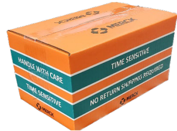
Diluent Shipping Container

A: The Diluent Shipping Container will be used with diluent-only orders or with accompanying frozen shipments sent out in the 33L and 77L Reusable Shipping Containers. The Diluent Shipping Container will have a similar appearance to the Reusable Shipping Container; however, the customer will not be required to return the Diluent Shipping Container to AeroSafe to be reused. It can be disposed of like any other cardboard box.